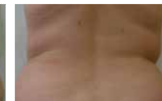
6 weeks AFTER second treatment