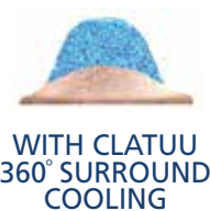
WITH CLATUU 360° SURROUND COOLING