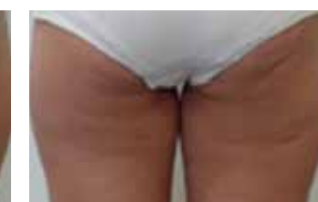
10 weeks AFTER second treatment