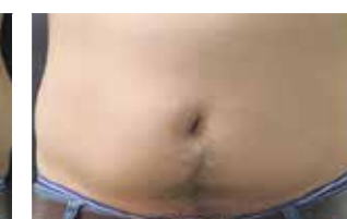
12 weeks AFTER one treatment